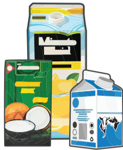
Food Cartons (empty and clean) Cartones de comestibles (vacíos y limpios)