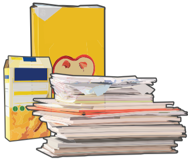
Paper (all colors and types) Papel (de todo color y tipo)