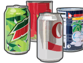
Aluminum and Steel Cans (empty and clean) Latas de aluminio y acero (vacías y limpios)