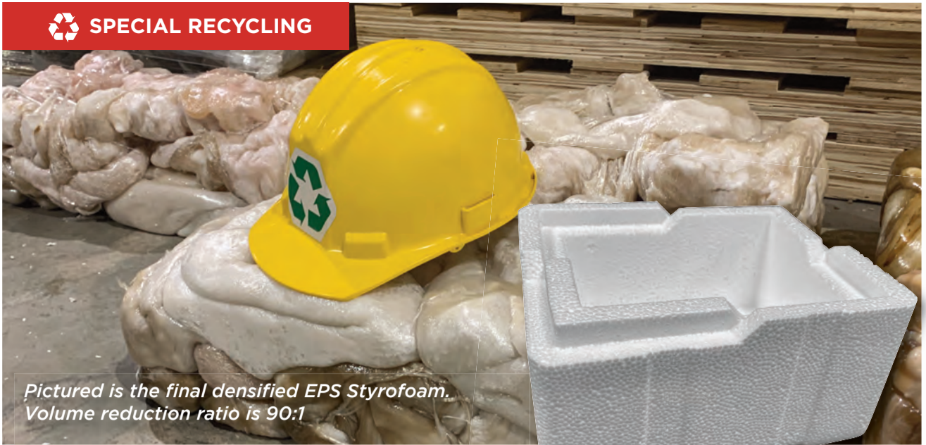
Pictured is the final densified EPS Styrofoam. Volume reduction ratio is 90:1

Locations and more information available at: trees.wasteline.org