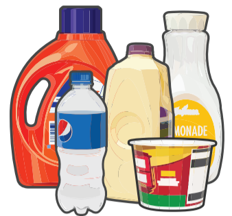
Plastic Bottles, Jars and Jugs (empty and clean) Envases de plástico (vacíos y limpios)