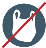
NO Plastic Bags or Plastic Wrap (return to retailer)