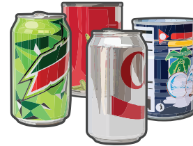
Aluminum and Steel Cans (empty and clean)