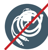
NO Tangles (no hoses, wires, chains, or electronics)