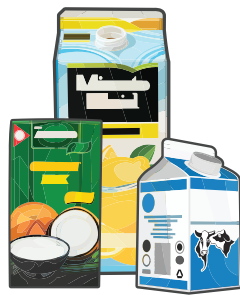
Food Cartons (empty and clean)