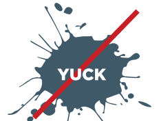
NO Food or Liquid (empty and rinse all containers)

For recycling drop-off site locations that also accept glass, visit omaharecycles.com