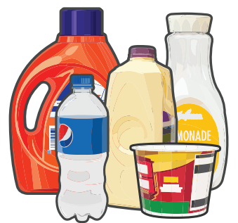
Plastic Bottles, Jars, Jugs, and tubs (empty and clean)