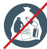
Do not Bag Recyclables (recyclables must be loose in cart)