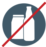
NO Glass (take to recycling drop-off location)