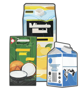
Food Cartons (empty and clean) Cartones de comestibles (vacíos y limpios)