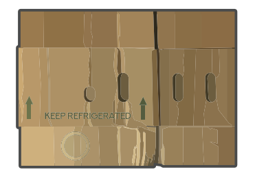
Cardboard (flatten) Cartón (desarmado)

Paper (all colors and types) Papel (de todo color y tipo)